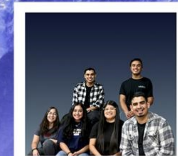
CHRIST MISSION COLLEGE WORSHIP